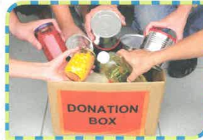
Food for the food bank

What do the people in our community need most?