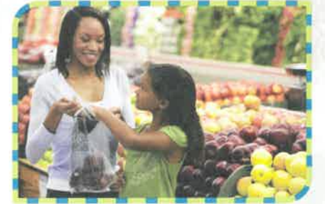
Grocery shopping help