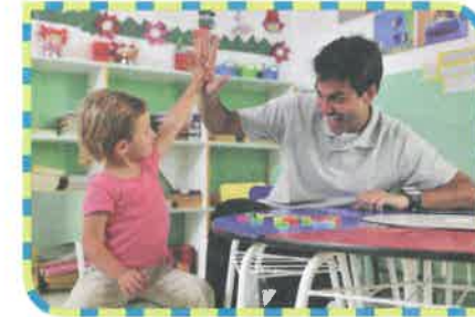
An afternoon of free child care