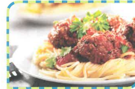
Free community meal