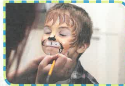
Party or carnival for the neighborhood